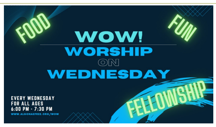
(Worship on Wednesdays) 6 - 7:30 pm

On Wednesday April 5th we will be telling the story of Easter through a Resurrection Egg Hunt. We will eat, hunt, hear the story and worship together!