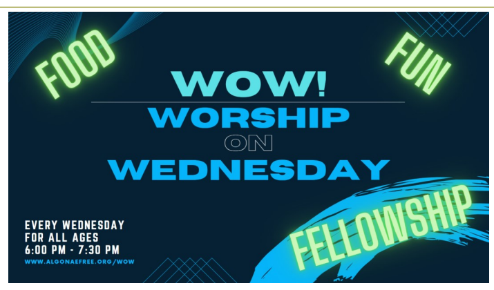
(Worship on Wednesdays) 6 - 7:30 pm

Join us every Wednesday for WOW. We will share a meal, dig into the Holy Spirit and worship together.