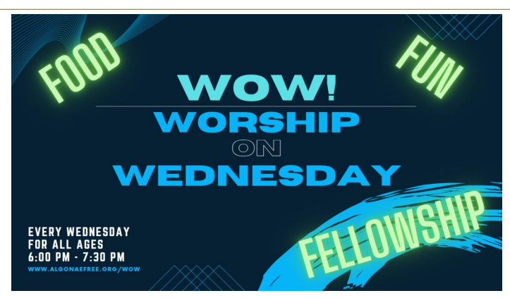
(Worship on Wednesdays) 6 - 7:30 pm

Join us every Wednesday for WOW. We will share a meal, dig into the Holy Spirit and worship together.