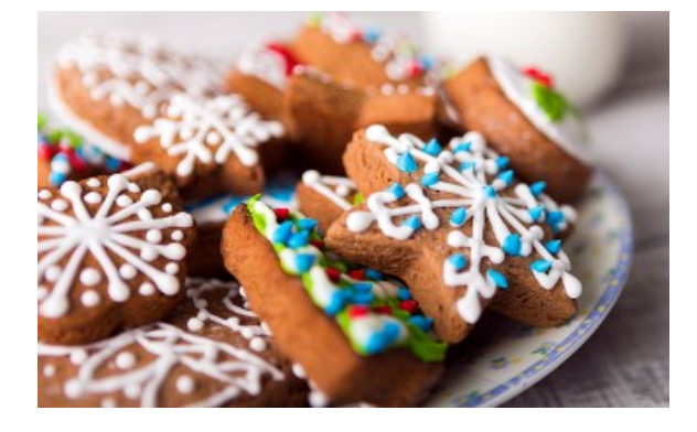
Sunday Morning Treat Sign Up

See email for more details or talk to Pastor Al