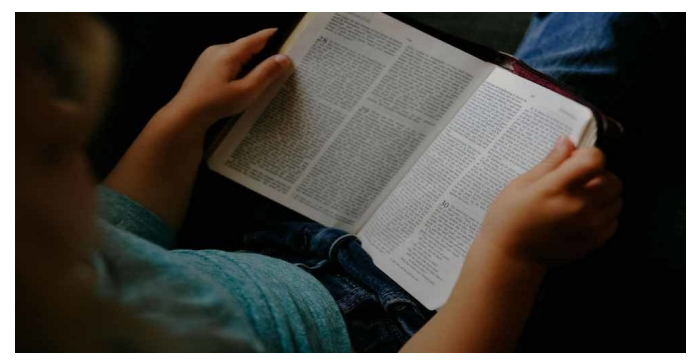
High School Youth Bible Study Weekend